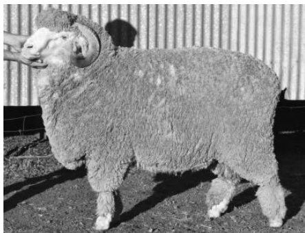
A60128, 22.2mic, 14.1cv, 98.9comf, 154kg DOB 1/6/23