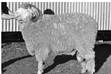
A60126, 20.5mic, 15.9cv 99.4comf, 148kg DOB 1/7/23